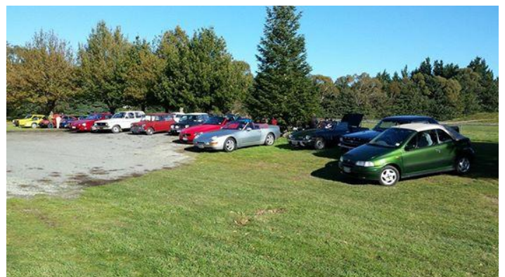
A cross section of the cars at Scargill