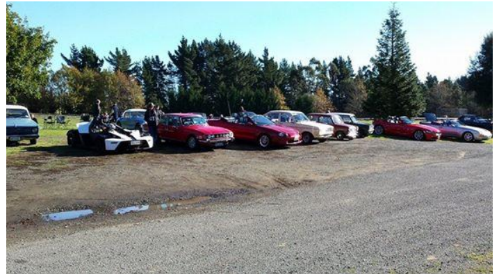
Scargill Domain – Note the new car model soon to be available in Christchurch.