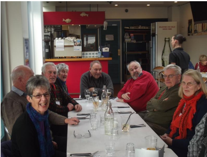
An enjoyable lunch is anticipated!

A very cold and rainy day did not stop 8 cars attending this outing. As it was mid-winter we decided to give ourselves a treat and we went to Akaroa and had lunch at Bully Hayes. It was too cold to explore Akaroa ( but there were 2 kyacks out on the bay) so we drove back to Lincoln for that all important coffee & cake. A great mid-winter outing with friends.