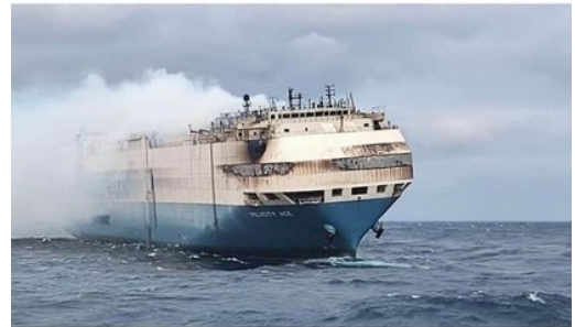
Felicity Ace on Fire carrying 4,000 Volkswagen Group models

Today's generation and all of us to a point are used to instant gratification and results.