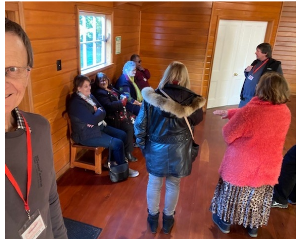
The after party who missed the message about going home

ps. I am writing this from Melbourne. We came for our daughters 40th birthday. We had planned a full day, train into city, lunch, art gallery, theatre - watch Top Gun then out for dinner which she had booked weeks ago.