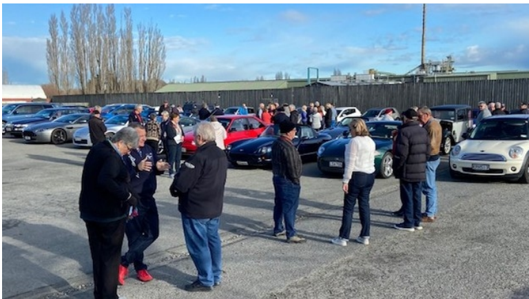
1. Gathering of the Clan