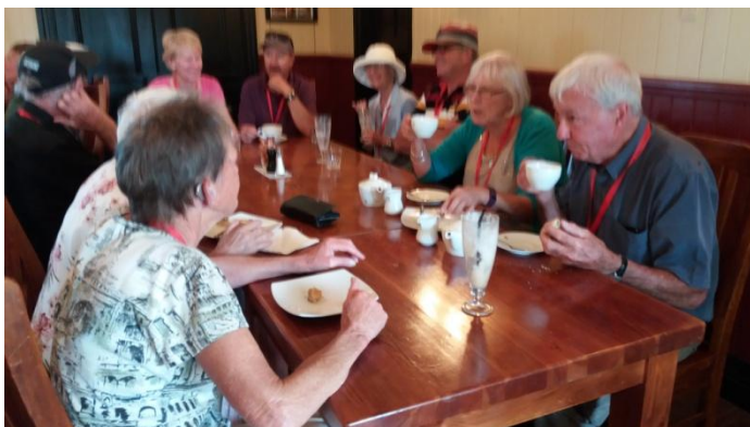
Coffee and Cake - always an important part of the day