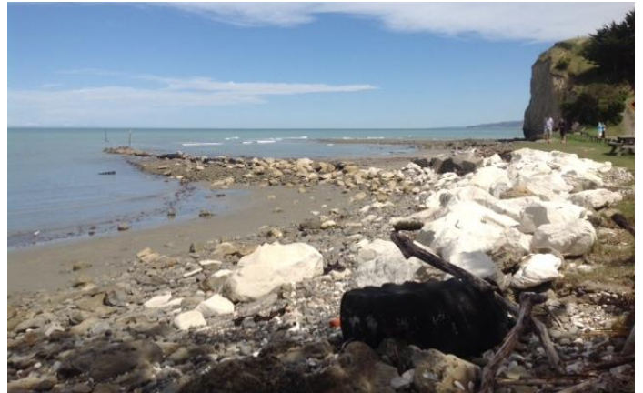
Large Limestone Rocks at Motanau Beach