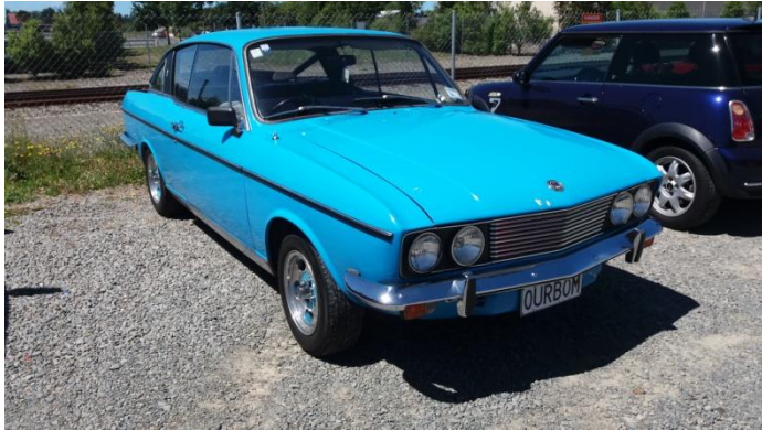
Lillian's beautiful Classic Car

We drove along the Motorway to cross the Waimak Bridge and take the first exit onto Tram Road. A lovely straight drive to Carleton where we turned Left for the short run into Oxford.