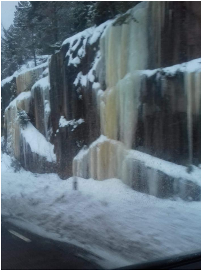
Frozen Waterfall