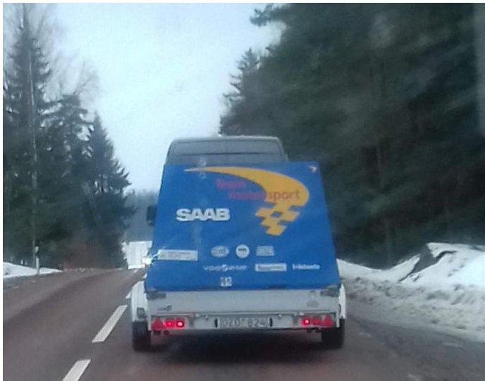
One for Sharpie