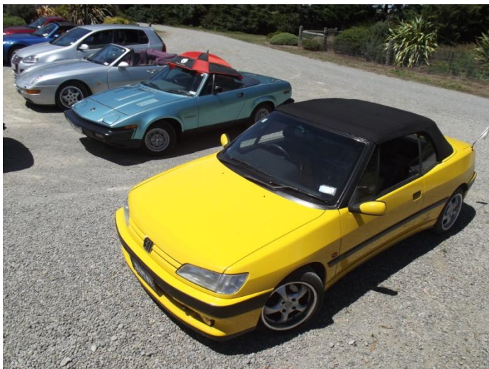
A good way to keep the car cool

We left the meeting place on a warm sunny morning 16 cars in total. We drove toward the Old West Road through West Melton enjoying the countryside. We turned at Minchins to cross the Waimak Bridge through Oxford and on to Cust Domain for the lunch stop. We sorted out a shady spot under a big tree and enjoyed our usual friendly get together over lunch. The temperature was predicted to be 30 degrees this day so we were happy to move on to Soda Cafe for Coffee and Cake indoors. Gill Milne.