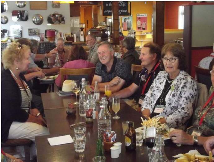
Members enjoying lunch at the Fossil Point Cafe

They opened especially for us on the day and by now we do hope the road being open through to Picton has allowed the Cafe to open 7 days. We travelled back along the Main Highway to Waikuku to Brick Mill Cafe for Coffee and Cake and a browse in the interesting shops there. Thankyou all for making the opening worthwhile for Fossil .Gill Milne.