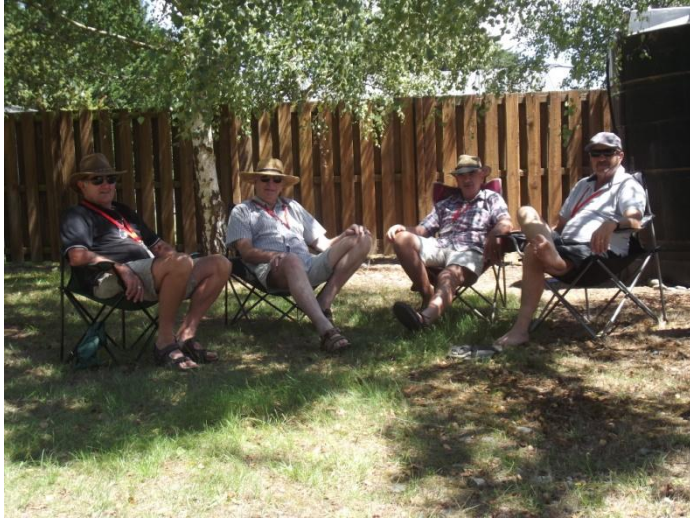
The brains trust sorting out the world!

We left the meeting place on a warm sunny morning 16 cars in total. We drove toward the Old West Road through West Melton enjoying the countryside. We turned at Minchins to cross the Waimak Bridge through Oxford and on to Cust Domain for the lunch stop. We sorted out a shady spot under a big tree and enjoyed our usual friendly get together over lunch. The temperature was predicted to be 30 degrees this day so we were happy to move on to Soda Cafe for Coffee and Cake indoors. Gill Milne.