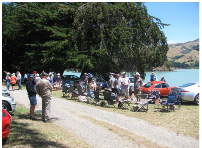
Time for a yarn

We were pleasantly surprised with the large number of members who decided to make the first run of the year. We left PMH and travelled along the Heathcote River until we reached Colombo St where we turned right and climbed the Port Hills to the Sign of the Kiwi. Negotiating cyclists was the challenge for the day. The drive along the Southern Summit Road is a favourite with varying views of the City, The Harbour, and Lake Ellesmere. At the summit of Gebbies Pass we turned Left to head towards Teddington and then Right to go around the edge of Lyttelton Harbour – through Diamond Harbour and Purau. Then the windy drive over the hill to Port Levy. After a relaxing lunch stop we again skirted the Harbour to Lyttelton and through the tunnel to our Coffee & Cake stop at Ferrymead. A very enjoyable day out. Gill Peters