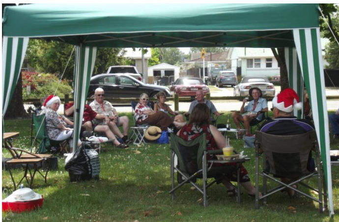
A relaxing spot for lunch at the Craighead Reserve

Then over the Sign of the Kiwi and down into Governors Bay where we could see the Lyttelton Harbour in all its glory - Over Gebbies Pass to see the vista of Lake Ellesmere. Through Motokurara and down the side of the lake to travel through Springston South then another straight road through Burnham to Aylesbury. Then Highway 73 to Kirwee after a short while we turned right onto the Old West Coast Road and then left to travel around past Orana Park and all the activities that are held on McLeans Island. A short drive through Papanui took us to the Reserve where our Christmas Picnic was to take place.