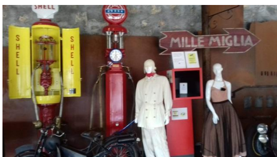
From Millie Miglia