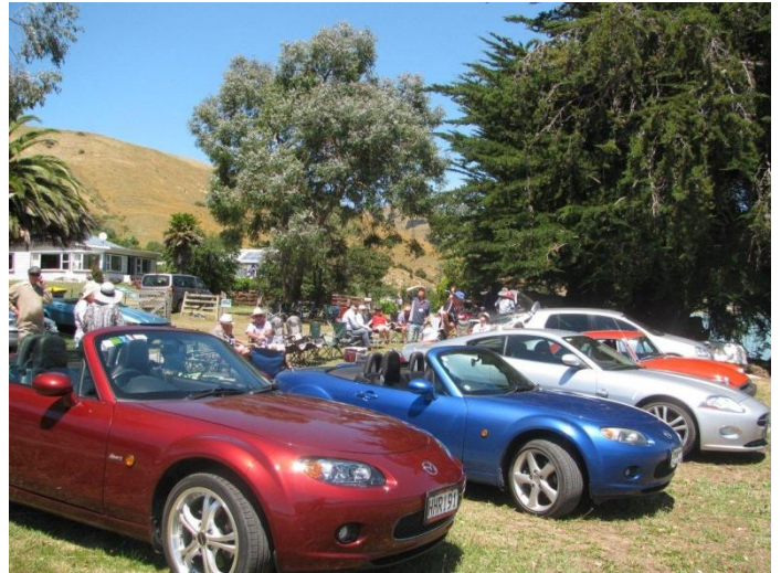
Lunch time at Port Levy

We were pleasantly surprised with the large number of members who decided to make the first run of the year. We left PMH and travelled along the Heathcote River until we reached Colombo St where we turned right and climbed the Port Hills to the Sign of the Kiwi. Negotiating cyclists was the challenge for the day. The drive along the Southern Summit Road is a favourite with varying views of the City, The Harbour, and Lake Ellesmere. At the summit of Gebbies Pass we turned Left to head towards Teddington and then Right to go around the edge of Lyttelton Harbour – through Diamond Harbour and Purau. Then the windy drive over the hill to Port Levy. After a relaxing lunch stop we again skirted the Harbour to Lyttelton and through the tunnel to our Coffee & Cake stop at Ferrymead. A very enjoyable day out. Gill Peters